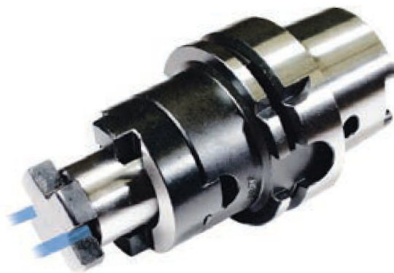
HSK - A

HSK-A63 with internal coolant supply, for tools with coolant channel to the cutting edge